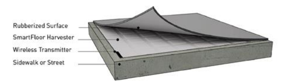
Pedestrian SmartFloor Application