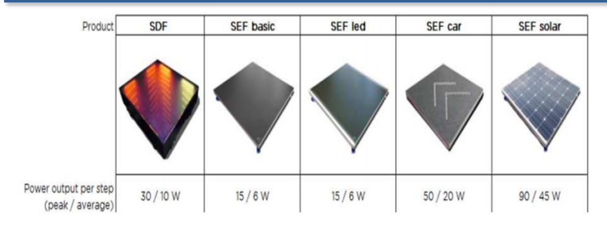
Figure (1) (SEF) tiles (<u>www.rdso.indianrailways.gov</u>)